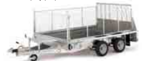
GX range is available with mesh sides (ramp model only)

All our plant models are fitted with integrated ramp and skid supports. This standard feature ensures trailers are supported whilst being loaded without the need to deploy prop stands.