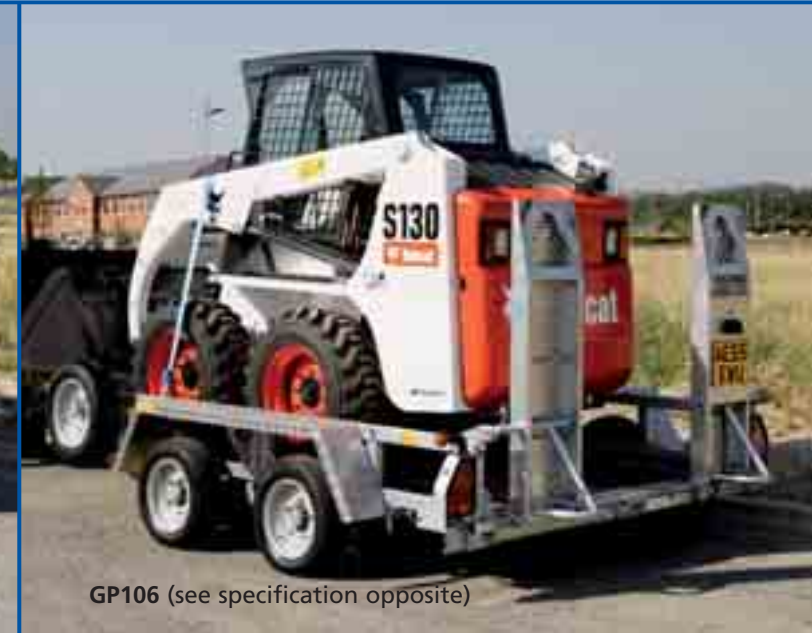
GP106 (see specification opposite)