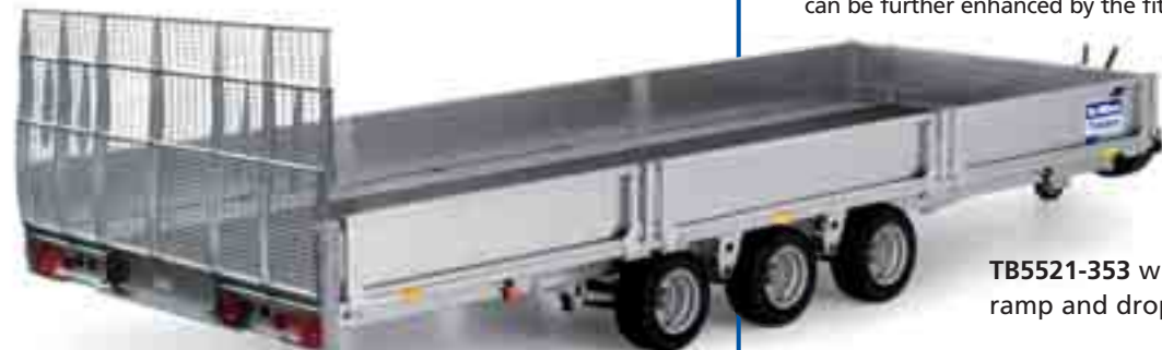
TB5521-353 with mesh rear ramp and drop sides.

In addition to the CT166 & 167 we have a new tiltbed series available offering six trailer models in a range of four lengths, two of which are available in a tri-axle version, and all offer a generous width of 2100mm (7'). Ideal for a range of vehicles including excavators and rollers. Please see our dedicated tiltbed brochure for more details.