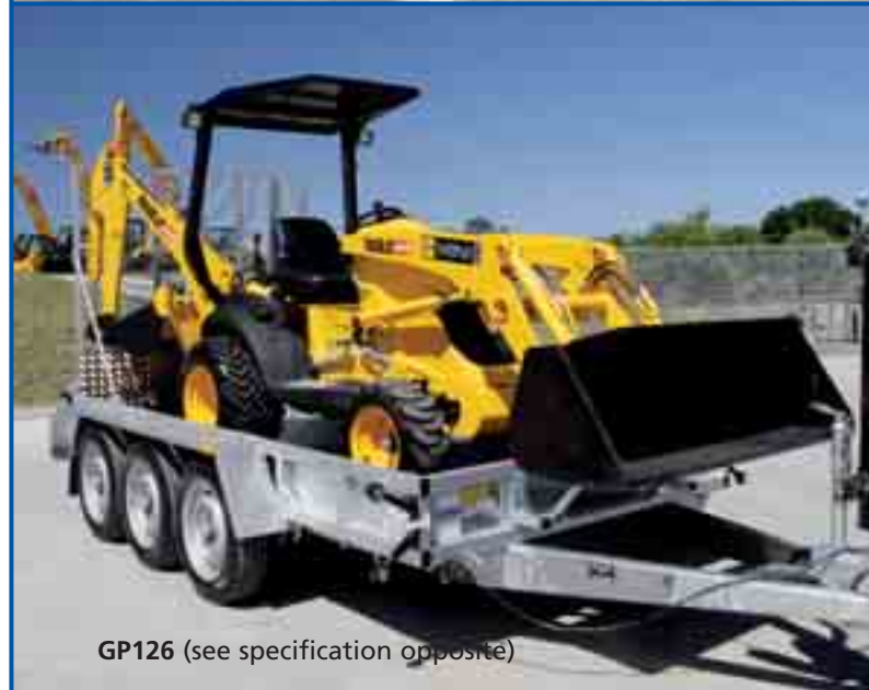
GP126 (see specification opposite)