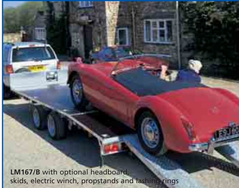
LM167/B with optional headboard, skids, electric winch, propstands and lashing rings