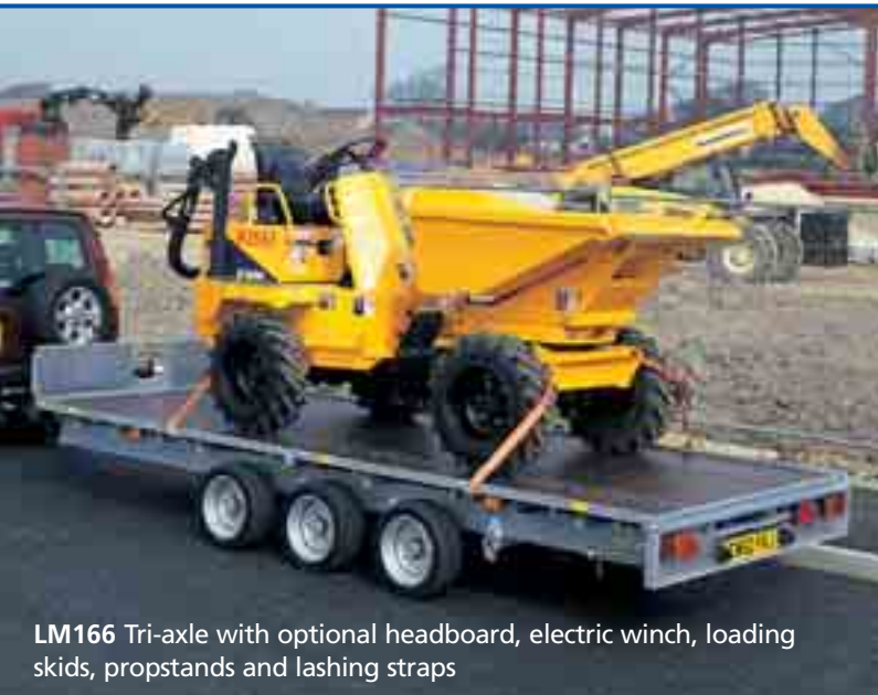
LM166 Tri-axle with optional headboard, electric winch, loading skids, propstands and lashing straps

The maximum gross weight for the LT model is 2000kg, whilst the heavier LM models offer between 2700kg and 3500kg.