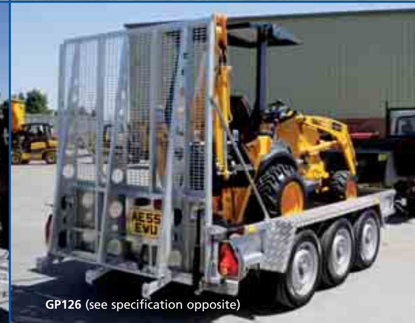
GP126 (see specification opposite)