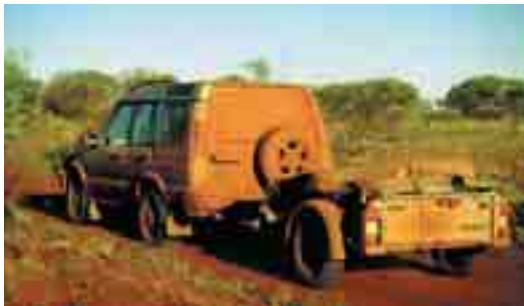
A GD64 at work in the Australian outback

Our General Duty trailers are at home in almost any environment, with virtually any type of load, from building materials to expedition equipment.