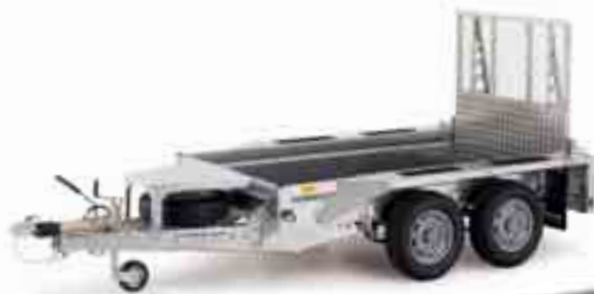
GX84 with ramp