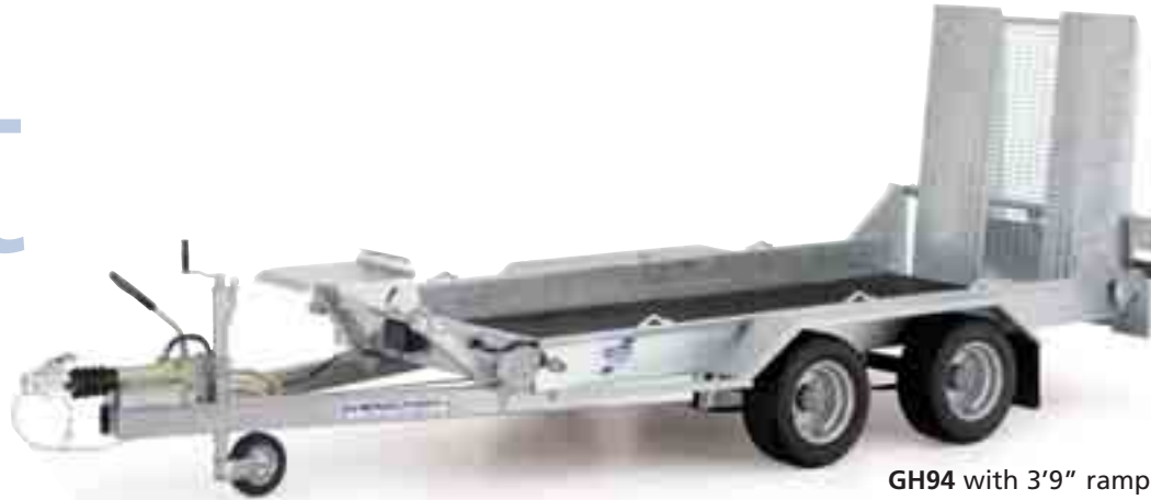
GH94 with 3'9" ramp

The GH is the latest addition to our plant trailer range and comes in three different platform sizes.