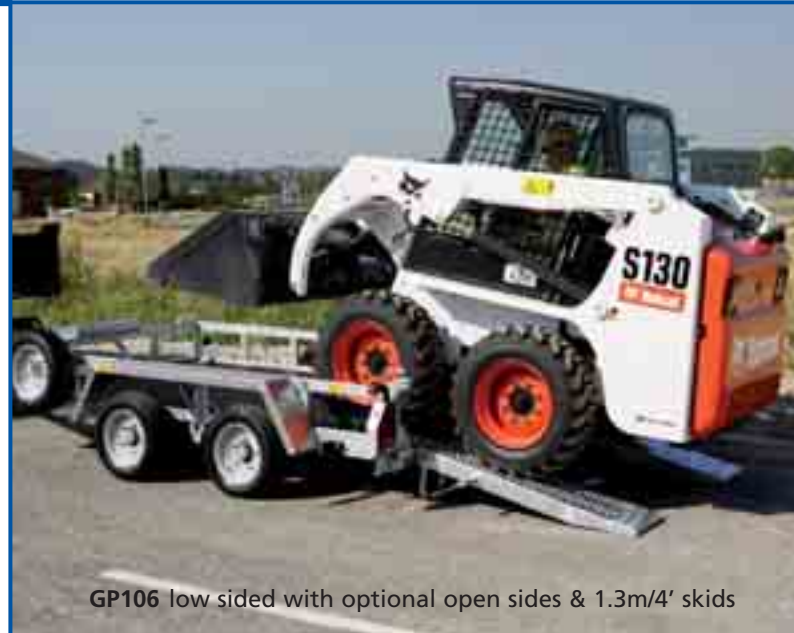
GP106 low sided with optional open sides & 1.3m/4' skids

High sided models come with filled in sides, an optional bucket rest and axles which are more centrally positioned. This option is ideally suited to users who require flexible usage from their trailer; a reliable plant trailer providing higher sides for use as a general duty trailer.