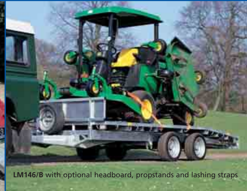
LM146/B with optional headboard, propstands and lashing straps