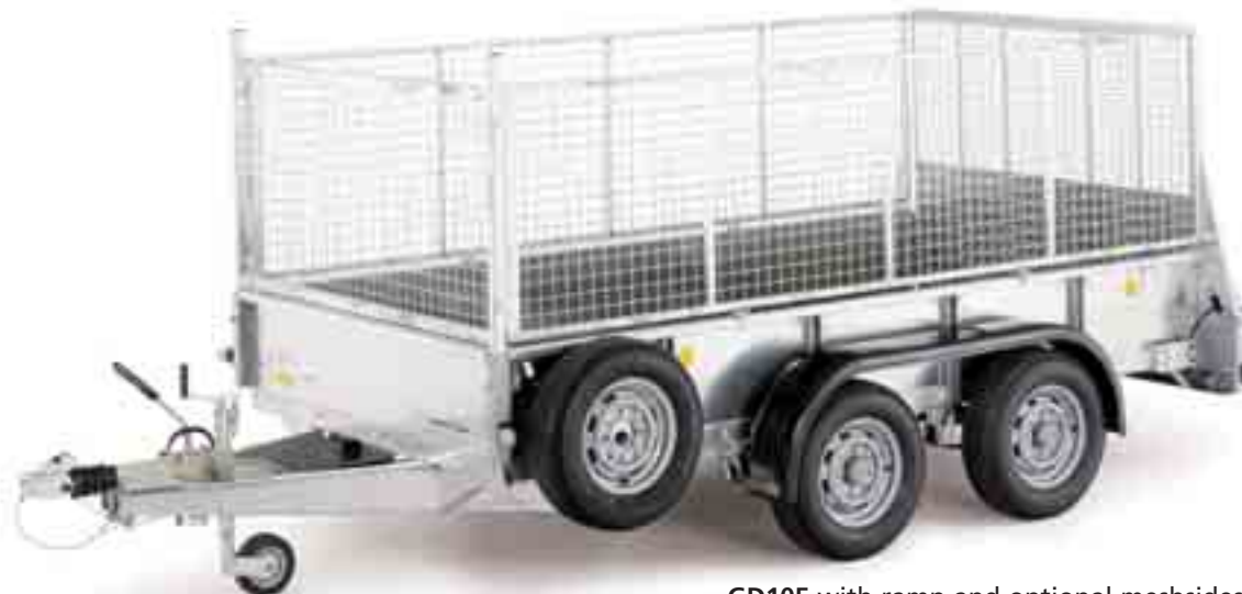
GD105 with ramp and optional meshsides