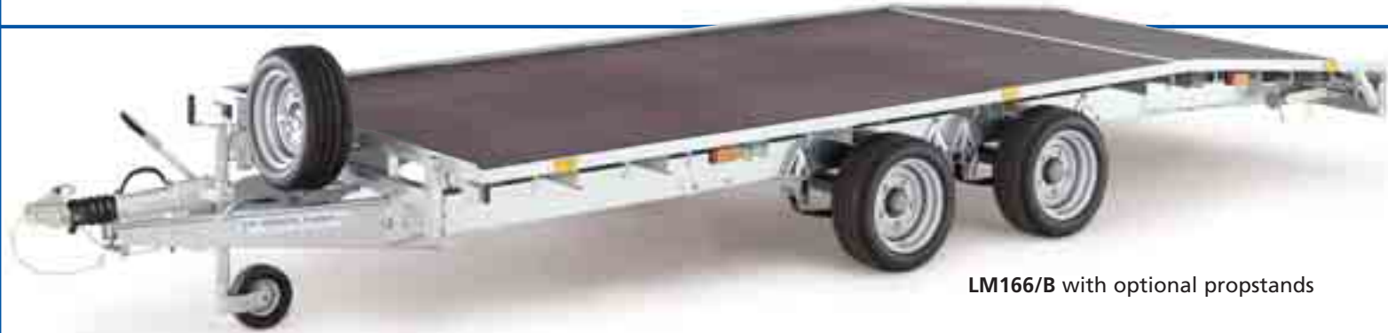
LM166/B with optional propstands

Vehicles with low ground clearance may not be suitable for loading on this type of trailer.