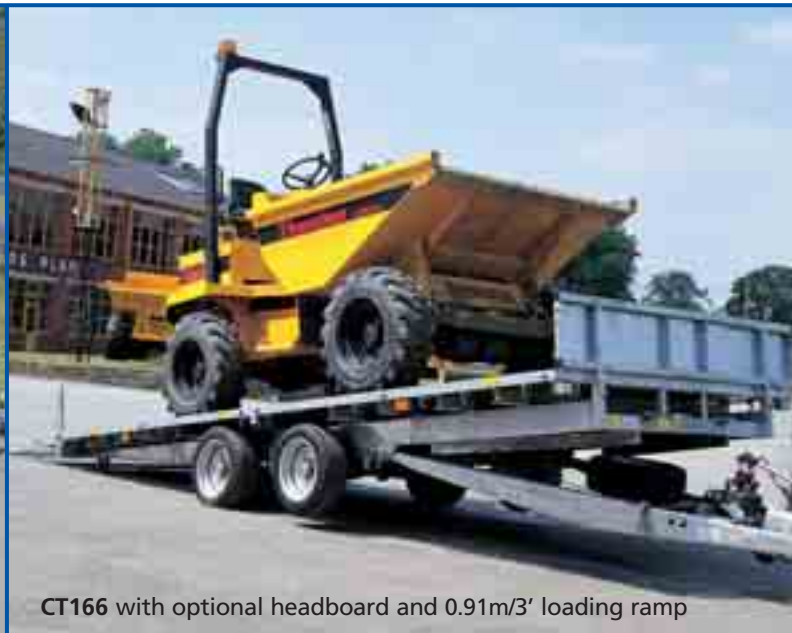
CT166 with optional headboard and 0.91m/3' loading ramp

For owners of vehicles with low ground clearance or those in the vehicle recovery business, the tiltbed is an ideal choice. It provides all the benefits of the flatbed range, combined with an easily-tilted platform for effortless loading.