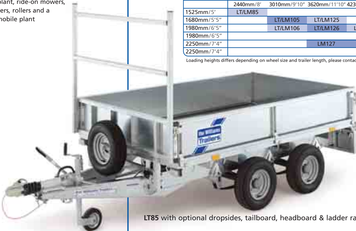
LT85 with optional dropsides, tailboard, headboard & ladder rack

Loading heights differs depending on wheel size and trailer length, please contact your local distributor for more information.