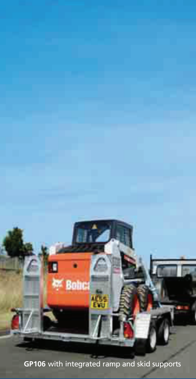
GP106 with integrated ramp and skid supports

Product design, descriptions, colours, specifications etc. correct at time of going to press. We constantly strive to improve our products, and from time to time this may result in changes to our range or to individual models. Please check that design, description, colours, specifications described in this brochure are still valid at the time of placing an order.