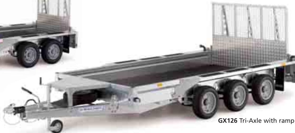
GX126 Tri-Axle with ramp

Trailers are offered with hinged adjustable skirts or a full-width loading ramp. Trailers can be further enhanced by accessories such as a ladder rack, aluminium treadplate floor covering, mesh side extensions (only practical with full-width loading ramp), bolt-on ramp knife edge, and 1.8m/6' skirts or ramp in place of the standard size of 1.2m/4'. The GX trailers come as standard with three pairs of integral lashing points attached to the body of the trailer.