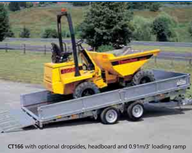
CT166 with optional drop sides, headboard and 0.91m/3' loading ramp