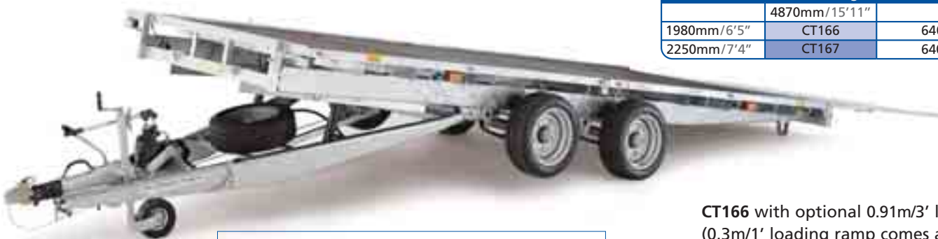
CT166 with optional 0.91m/3' loading ramp (0.3m/1' loading ramp comes as standard)