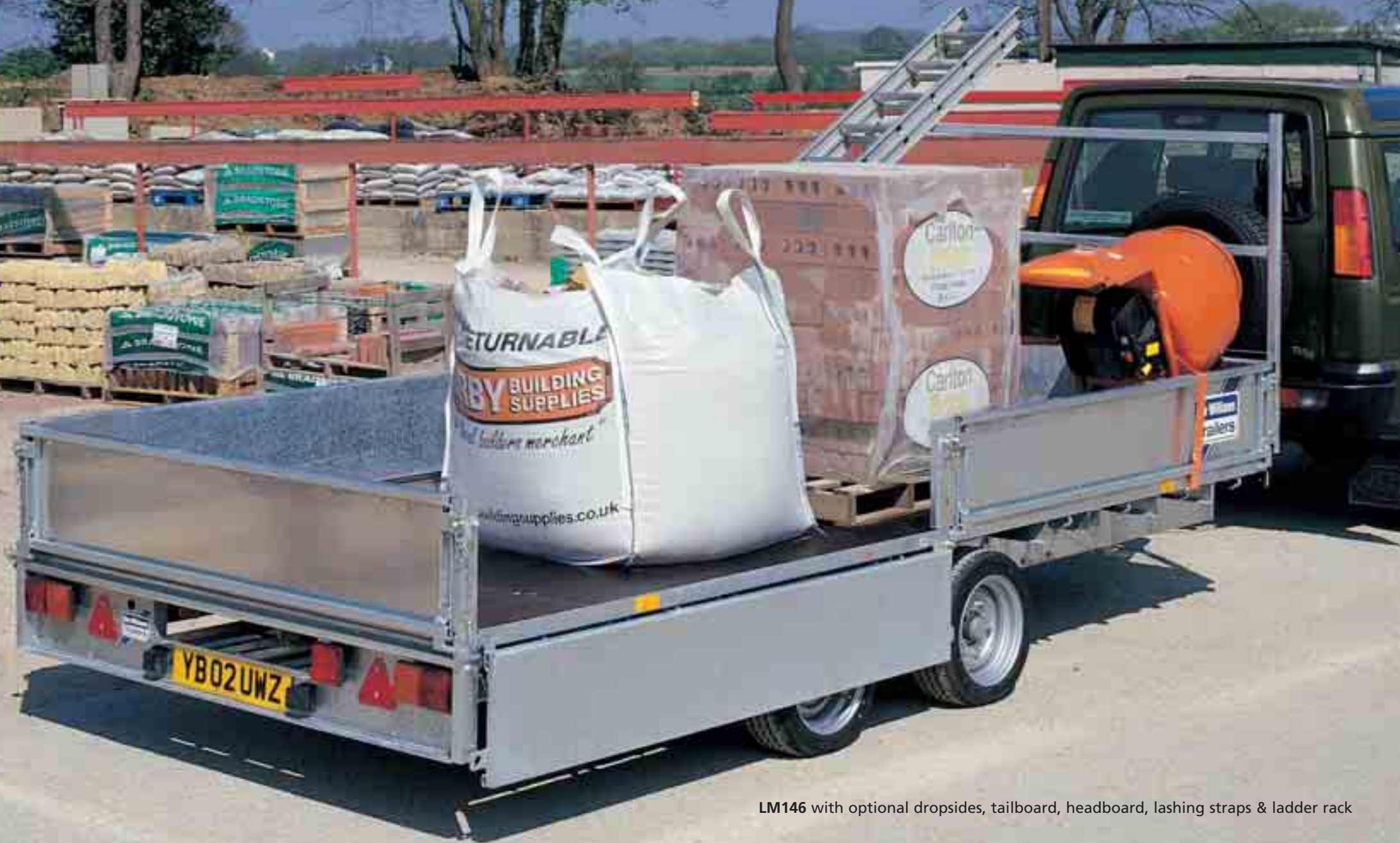
LM146 with optional dropsides, tailboard, headboard, lashing straps & ladder rack