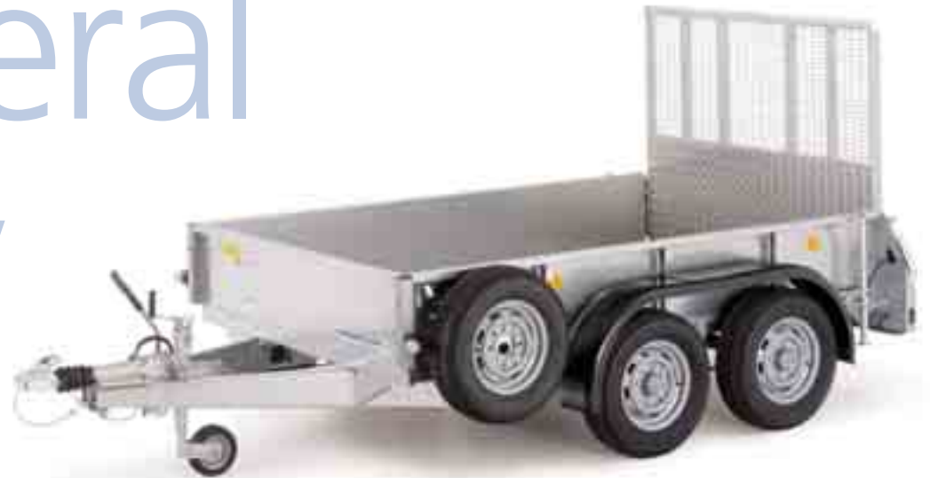
GD85 with ramp