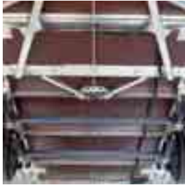
Chassis & floor

It's the attention to detail of Ifor Williams trailers that makes our products so popular with owners. Just take a look at these standard features.