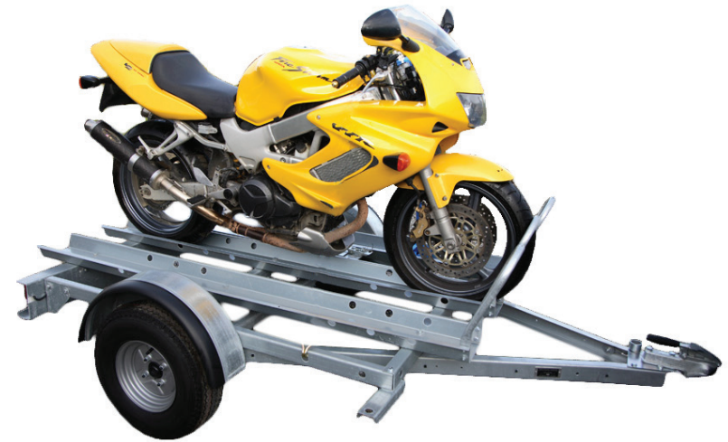
Triple Runner 500kg